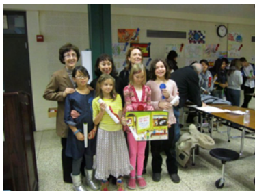
Participants of the Poetry Contest with teachers. Above: Students from Lincoln Elementary School in Oak Park and below, home-schooled high schoolers.