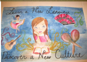
Above, Sobresaliente Posters